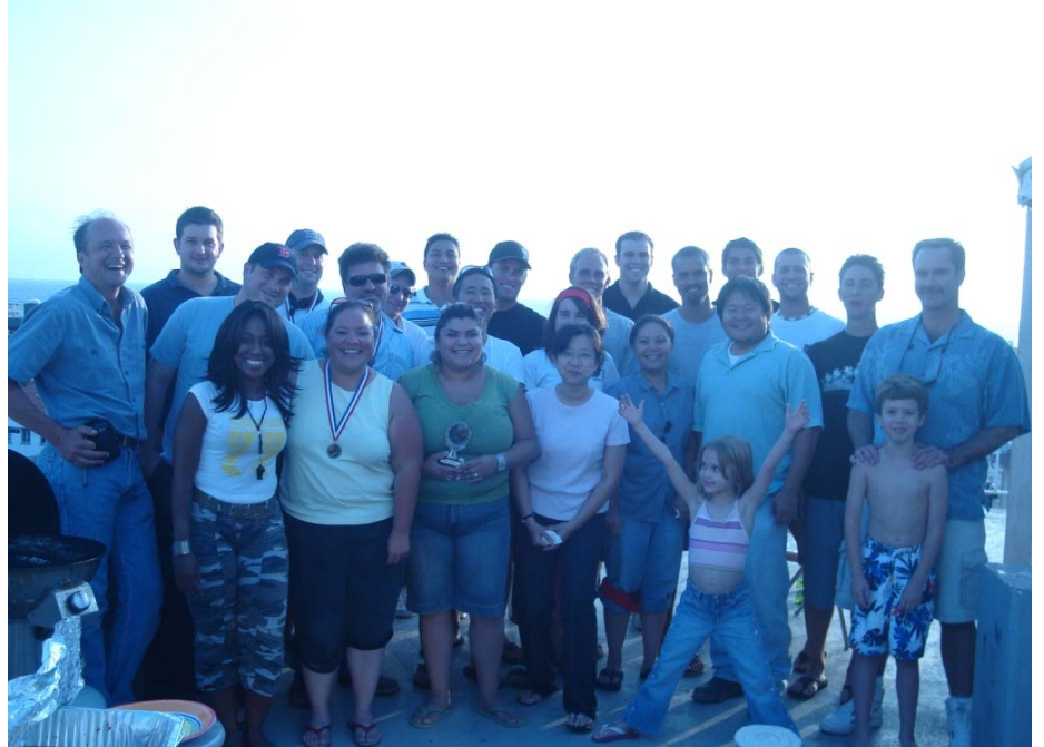
The Southern California Staff