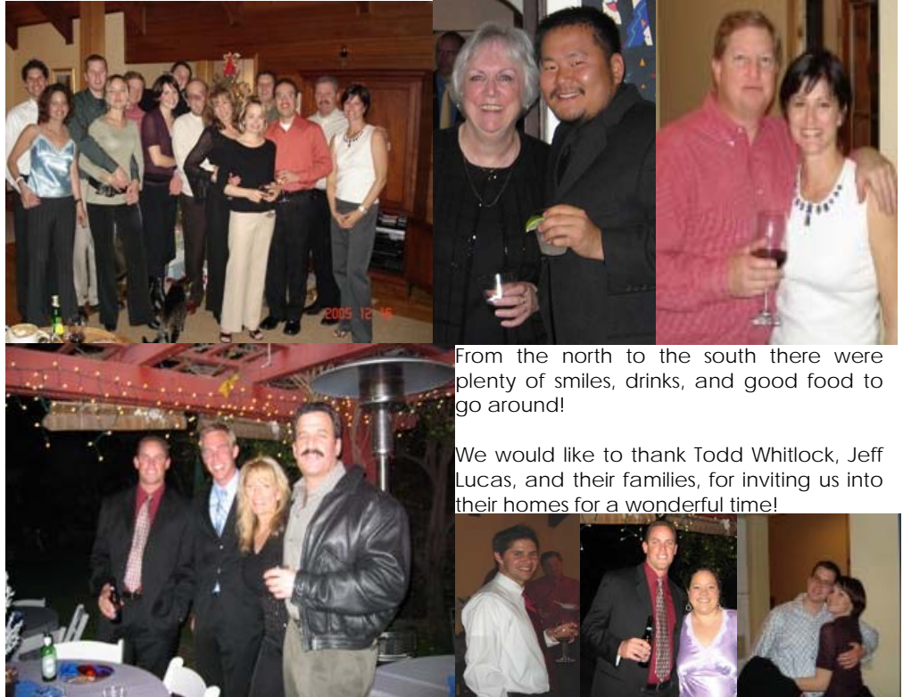
From the north to the south there were plenty of smiles, drinks, and good food to go around!